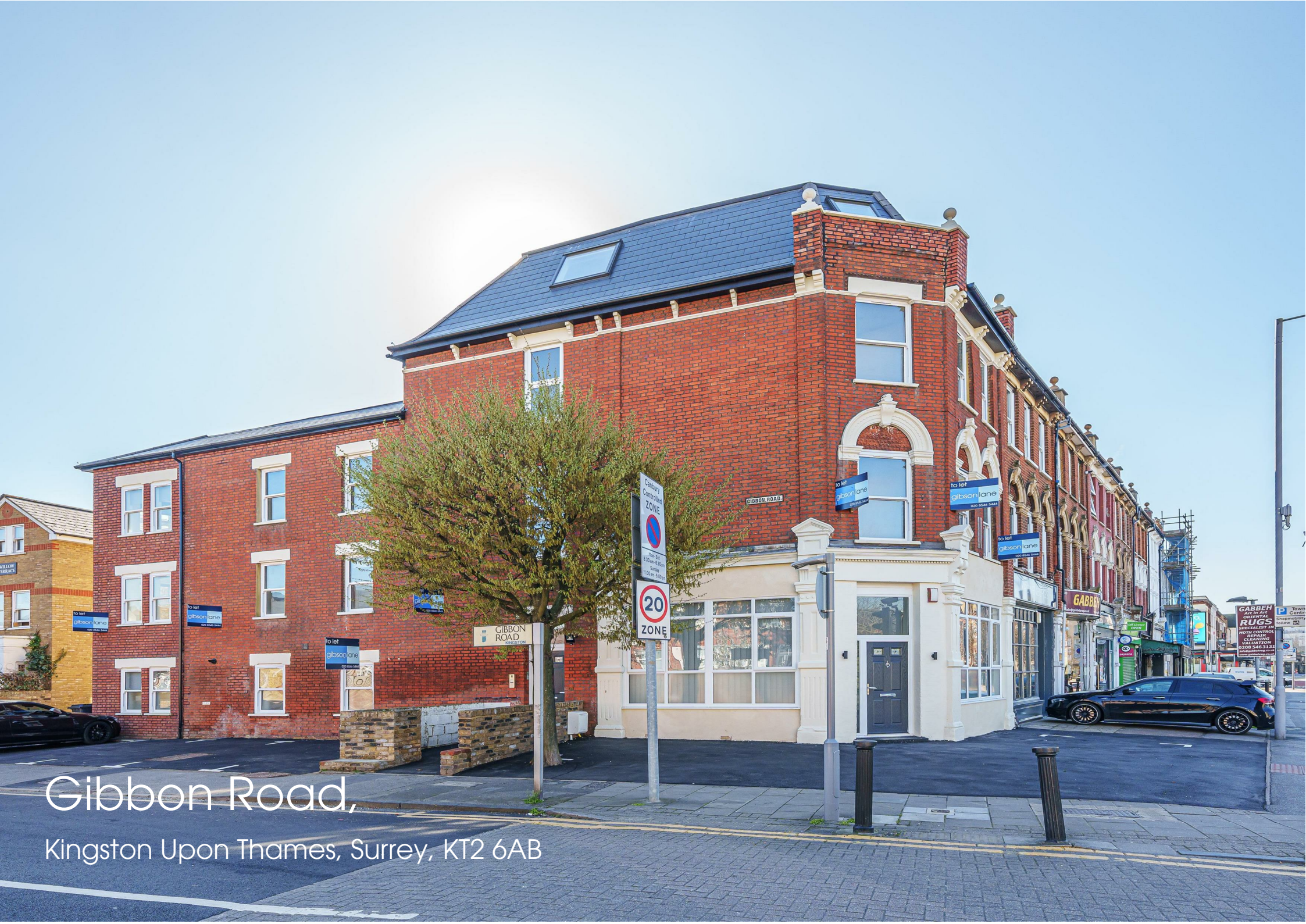
Gibbon Road, Kingston Upon Thames, Surrey, KT2 6AB